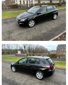
Low mileage example with a full service history.

Spec includes alloys, Bluetooth connectivity, touchscreen radio, sat nav, remote locking, air con, cruise control etc